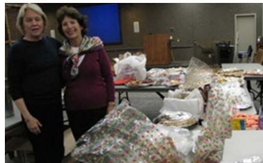
SU Twig 21 members spreading Holiday Cheer and serving up delicious treats.