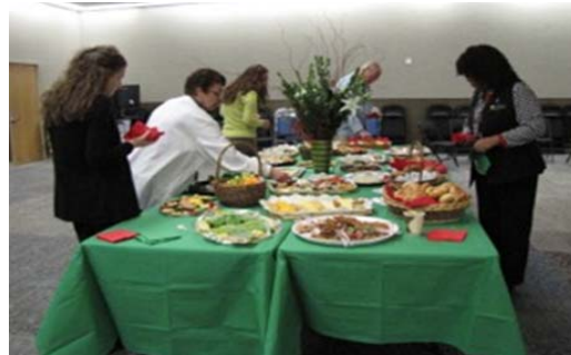
Overlook employees and staff enjoying baked goods and treats served at the Auxiliary Cookie Reception.