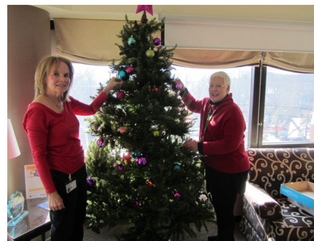
SU Twig 21 "elves" decorating Christmas trees throughout the hospital.